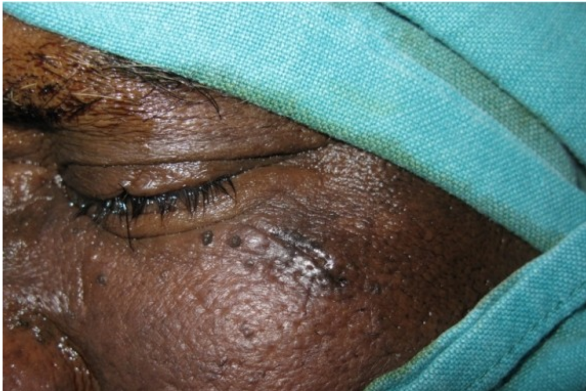
Figure 1: Scar with pigmentation left infraorbital region suggestive of residual disease

On examination, there was a 2 cm long transverse incision in the left infra orbital region with peri incisional induration and hyperpigmentation.